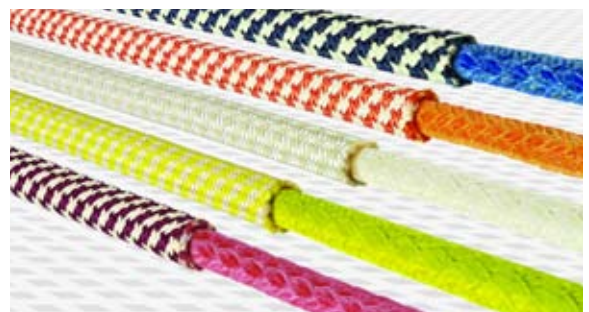
LIROS Xtreme ropes from HYS