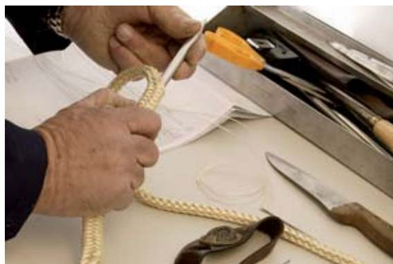
Eye splicing - traditional ropework