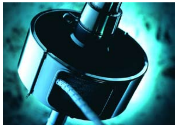
HYS Rigging - a distribution agent for Reckmann Products

Hamble Yacht Services also have strategically located servicing partners to assist with Superyachts that are too big for the Hamble River.