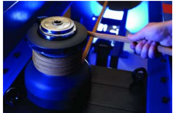
Rope cover friction testing at HYS Rigging

HYS Sparcare staff are all factory trained to take care of the supply, installation and servicing of hydraulic cylinders for the leading suppliers – Navtec and Sailtec, and look after many others including Holmatro and Seaway. They also cover the servicing and stock parts for Andersen and Lewmar winches.