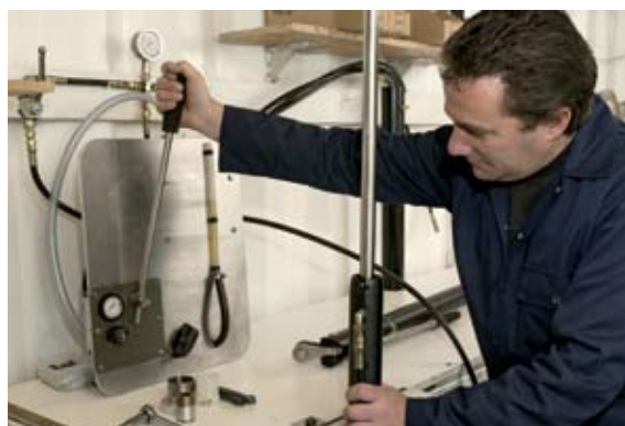
Servicing Hydraulic rams at HYS Sparcare