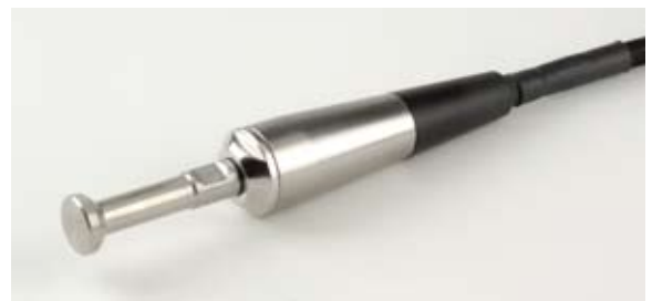
OYS - PBO Cable terminal