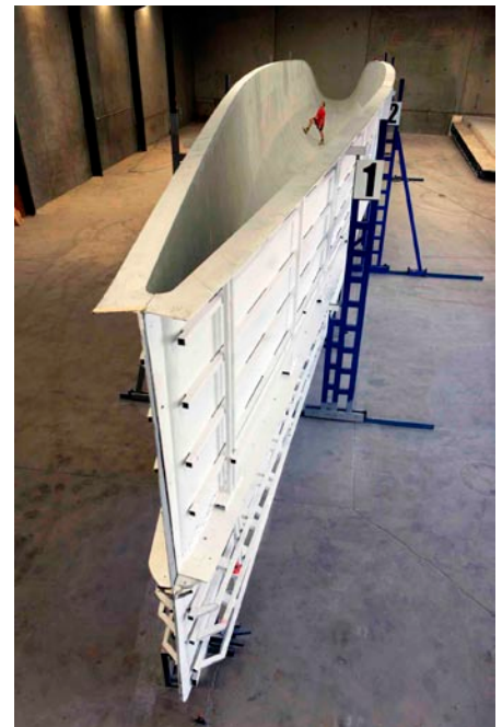
450sqm mould for French luxury superyacht project Nahema

Oyster Marine - http://www.oystermarine.com