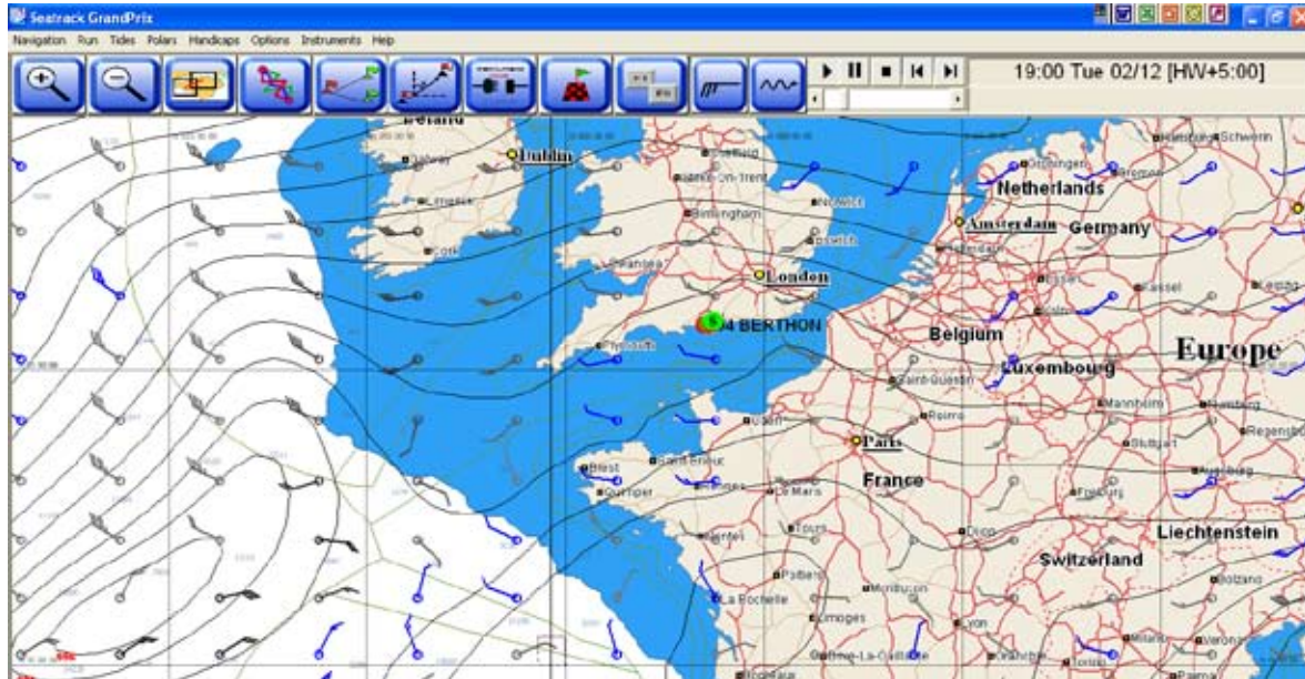
Weather - the big Seatrack picture

Version 9 of the Seatrack race tactical and navigational software includes some exceptional unique user function upgrades, and is due to launch just ahead of the London ExCel Boat Show in January 2009.