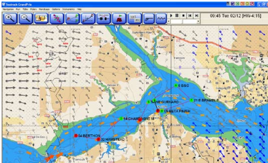
Weather - the seatrack detail